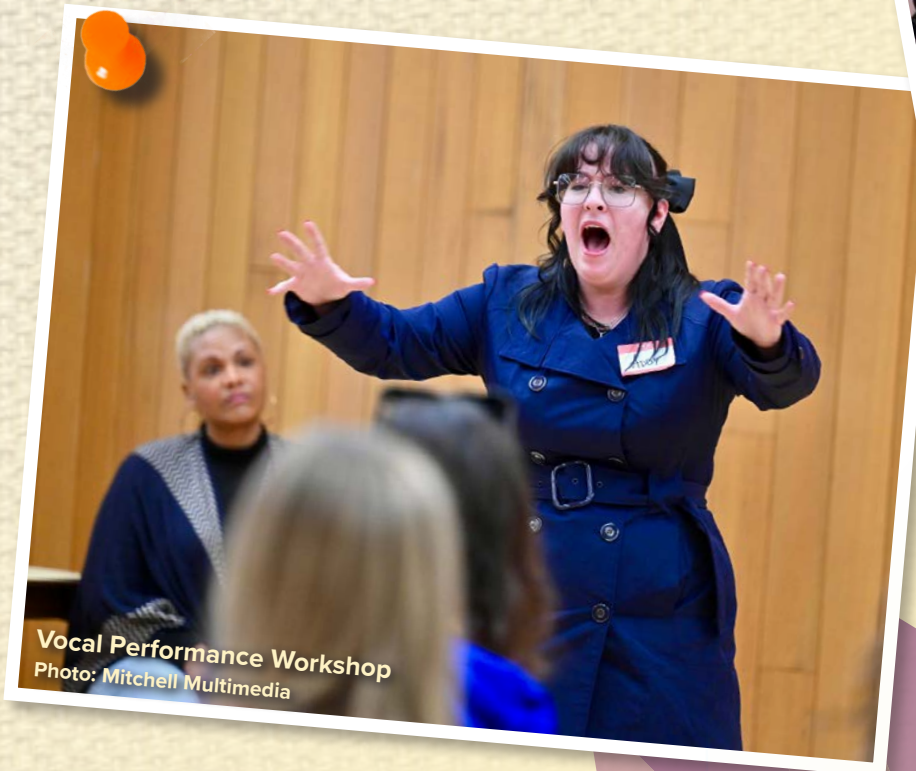
Vocal Performance Workshop