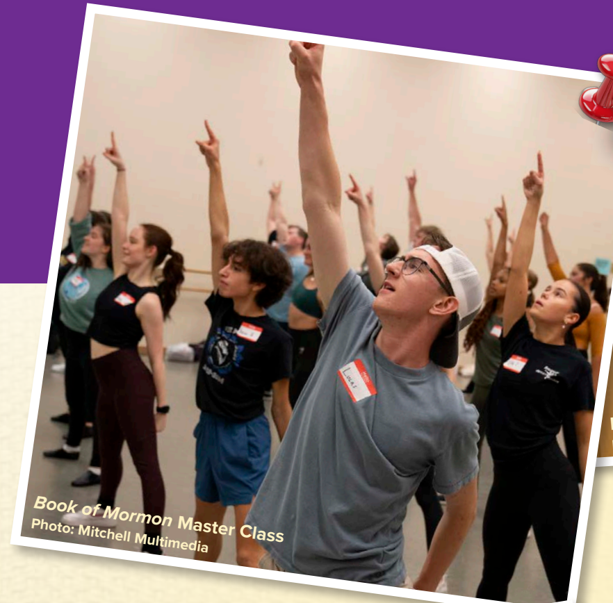
Book of Mormon Master Class

The remaining educational opportunities in 2024–2025 will include Broadway master classes with Peter Pan , & Juliet , and Funny Girl . Topics for our remaining local workshops include Improvisation, Dance Audition, and Costume Design.