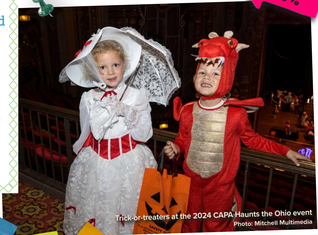
Trick-or-treaters at the 2024 CAPA Haunts the Ohio event