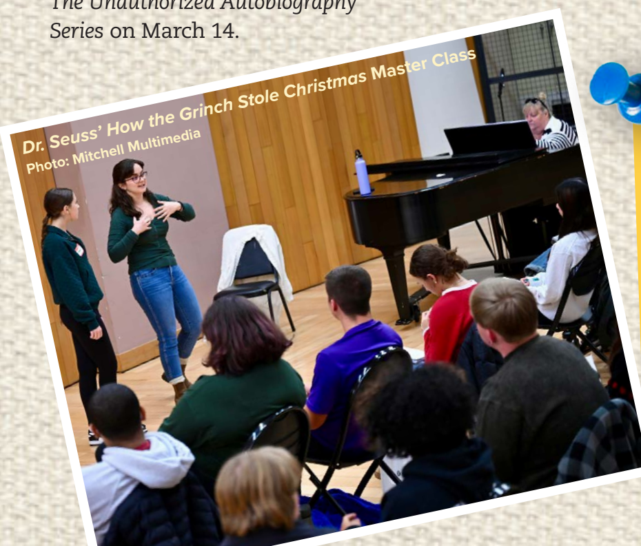
Dr. Seuss' How the Grinch Stole Christmas Master Class

Join us for a community performance of The Unauthorized Biography Series on March 14!