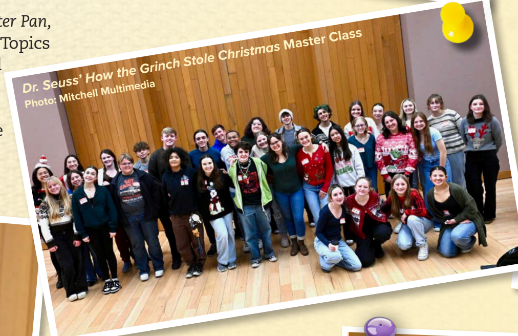
Dr. Seuss’ How the Grinch Stole Christmas Master Class