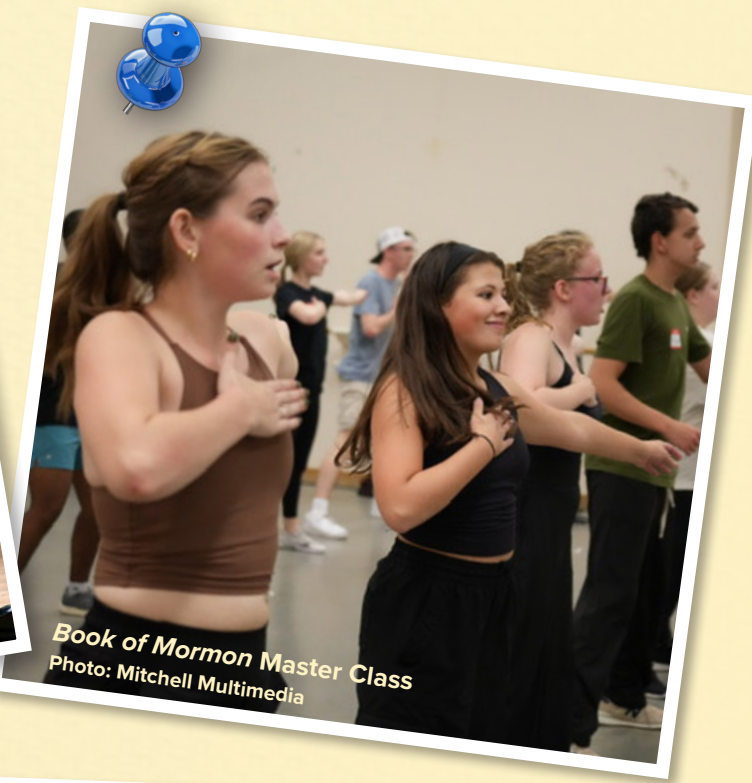
Book of Mormon Master Class