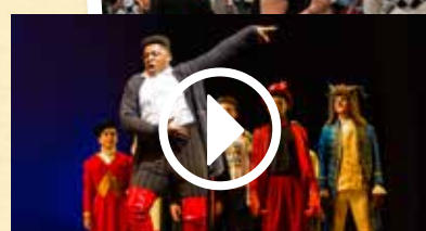
Click on the screen to watch the Christian perform in the character medley.”