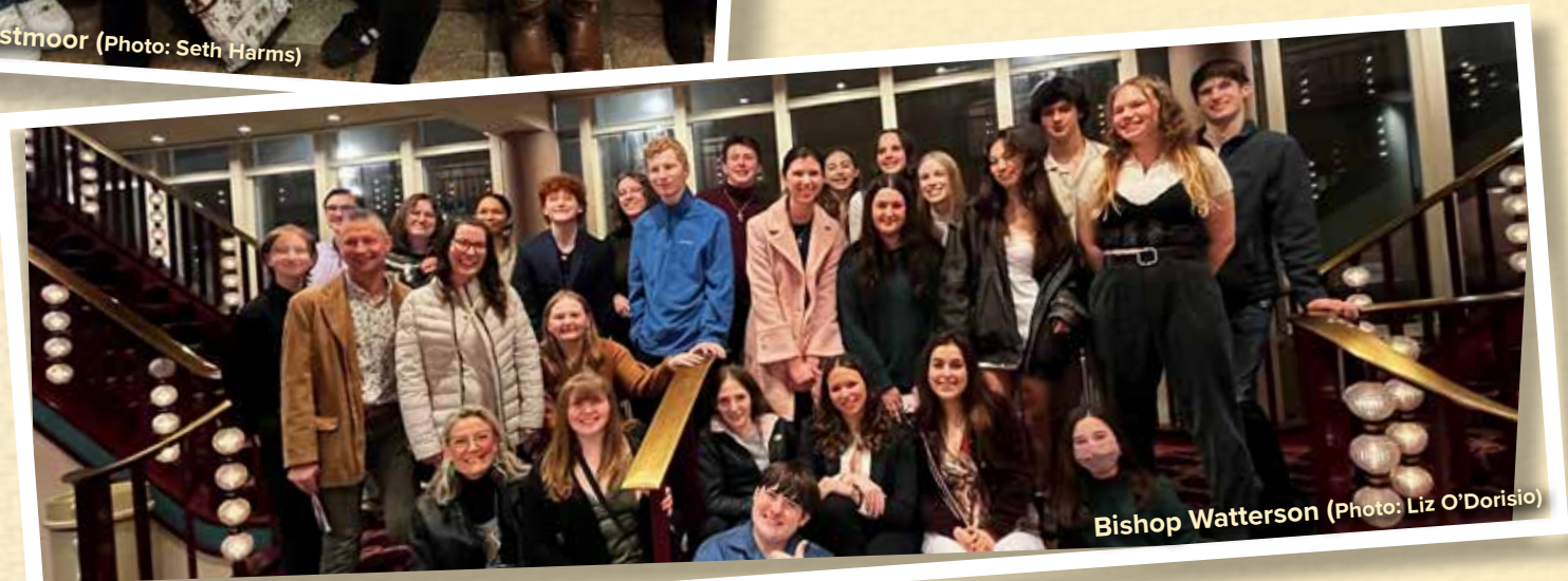
Bishop Watterson