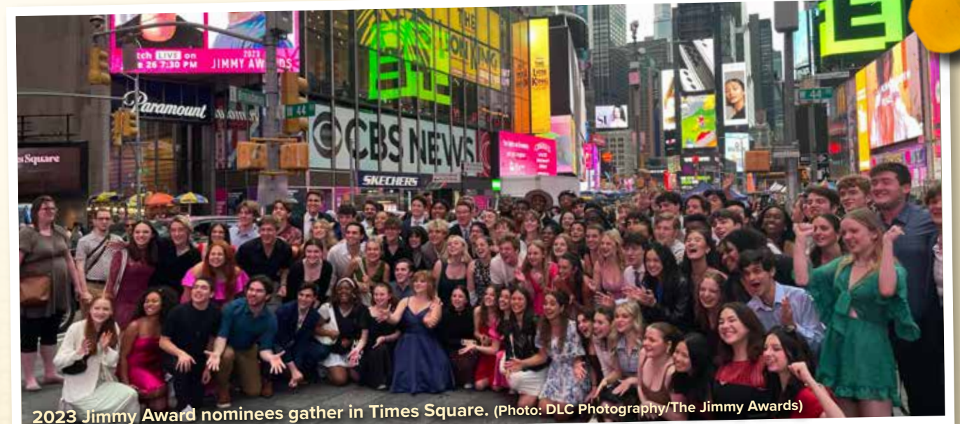
2023 Jimmy Award nominees gather in Times Square.