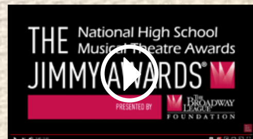
Click the screen to watch the 2023 Jimmy Awards® recap video.