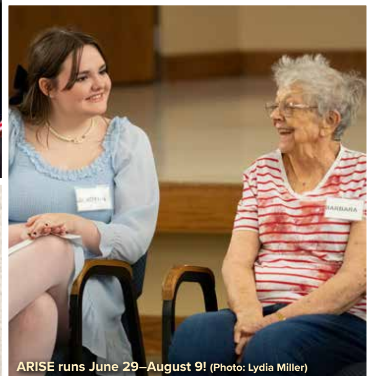
ARISE runs June 29–August 9!