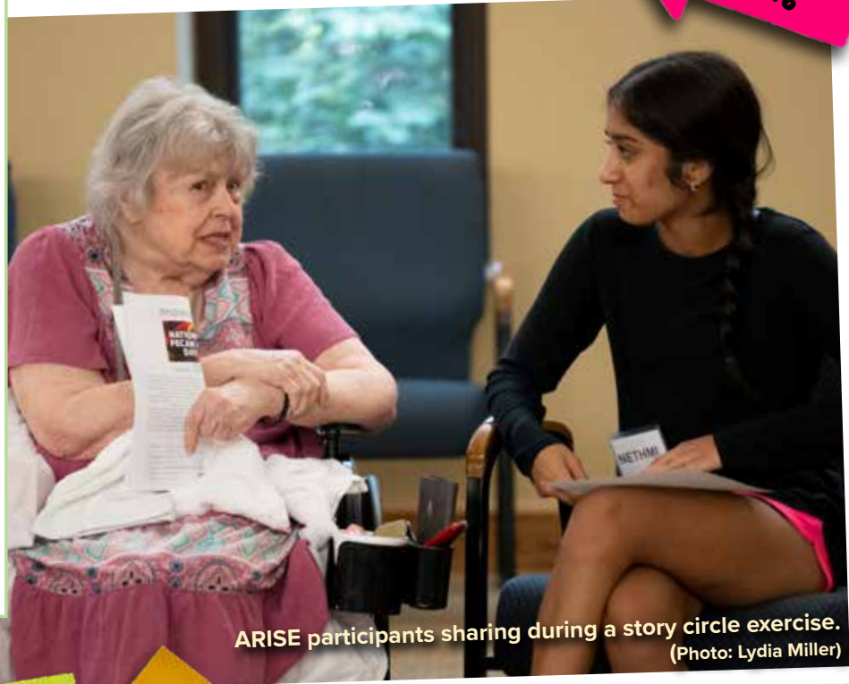
ARISE participants sharing during a story circle exercise.