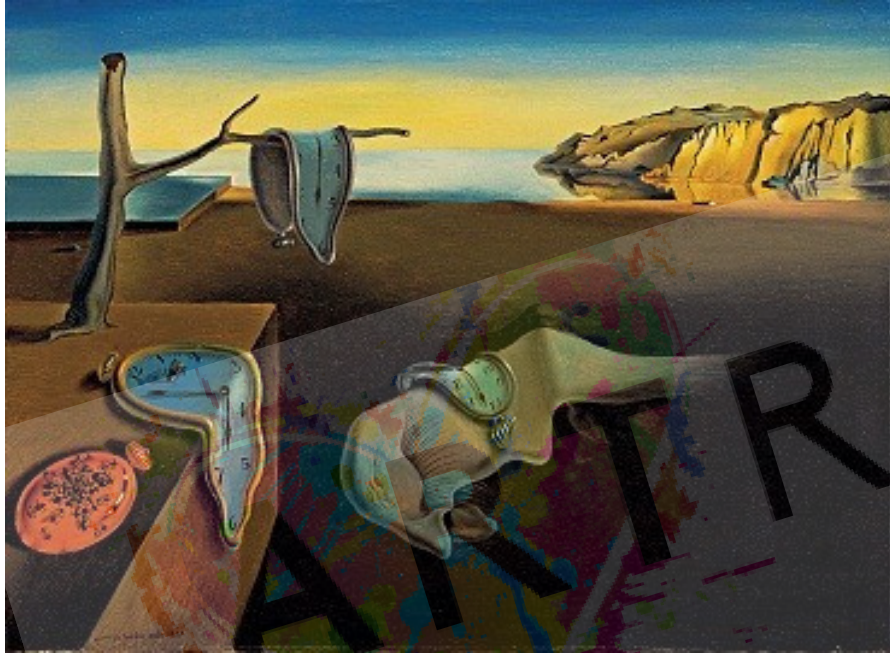
Salvador Dali ~ The Persistence of Memory, https://en.wikipedia.org/wiki/The_Persistence_of_Memory