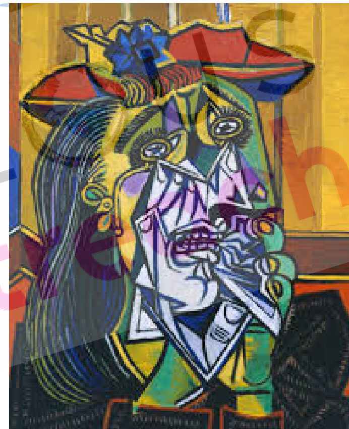
Pablo Picasso ~ The Weeping Woman, 1932 https://en.wikipedia.org/wiki/The_Weeping_Woman