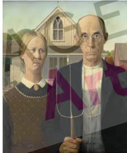
Grant Wood, American Gothic, 1930 https://en.wikipedia.org/wiki/American_Gothic