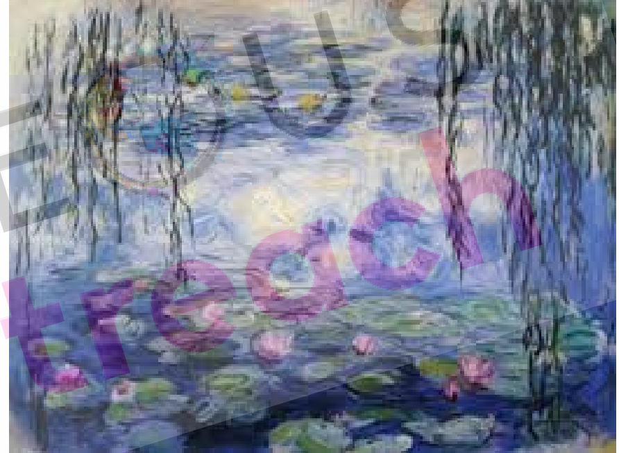
Claude Monet, Water Lilies, 1916 https://en.wikipedia.org/wiki/Water_Lilies_(Monet_series)