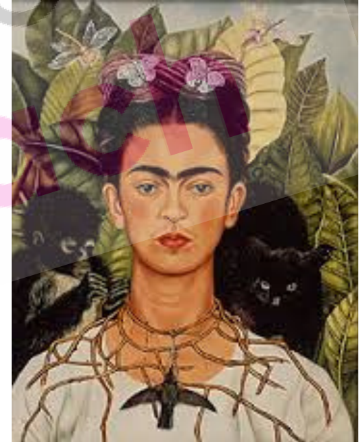
Frida Kahlo, Self-Portrait with Thorn Necklace and Hummingbird https://en.wikipedia.org/wiki/SelfPortrait_with_Thorn_Necklace_and_Hummingbird