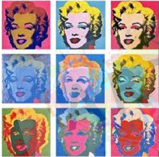
Andy Warhol, Marilyn Diptych, 1962 https://en.wikipedia.org/wiki/Marilyn_Diptych