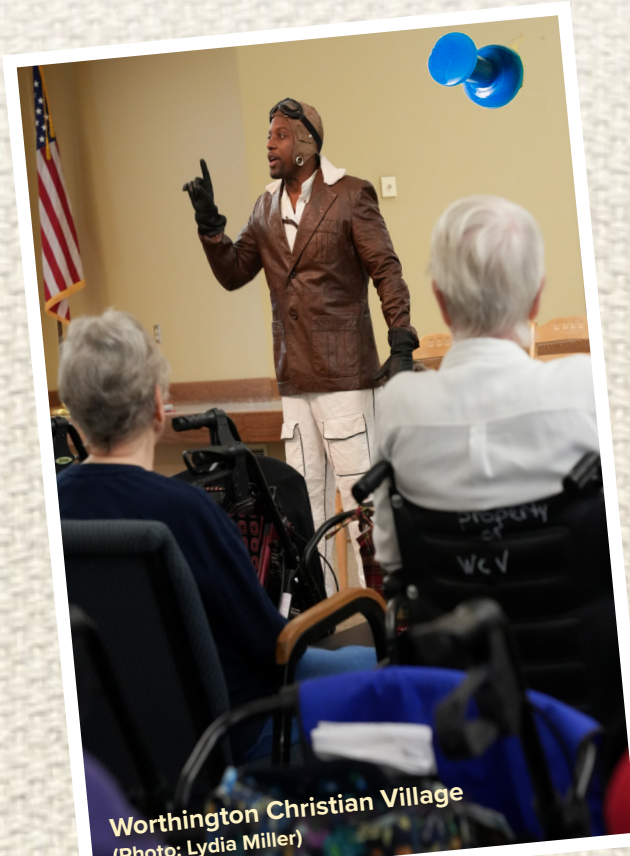
Worthington Christian Village