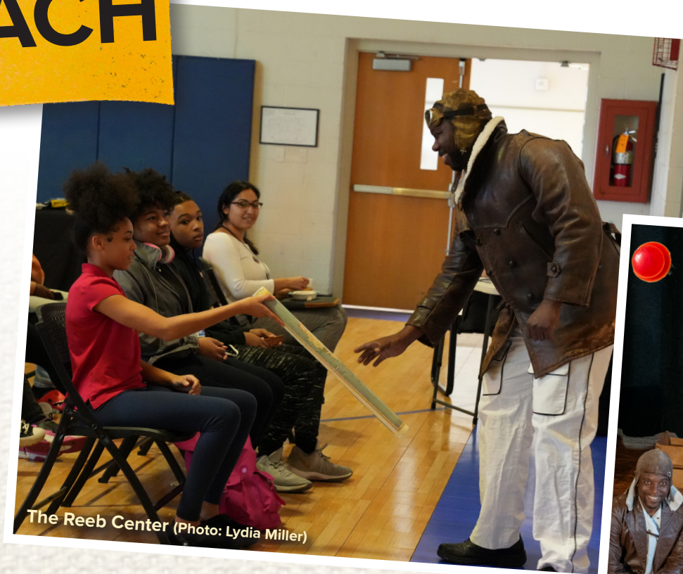
The Reeb Center

Thanks to the incredible support of our donors and sponsors we were thrilled to be able to offer these events at no cost to more than 1,500 members of the central Ohio community.