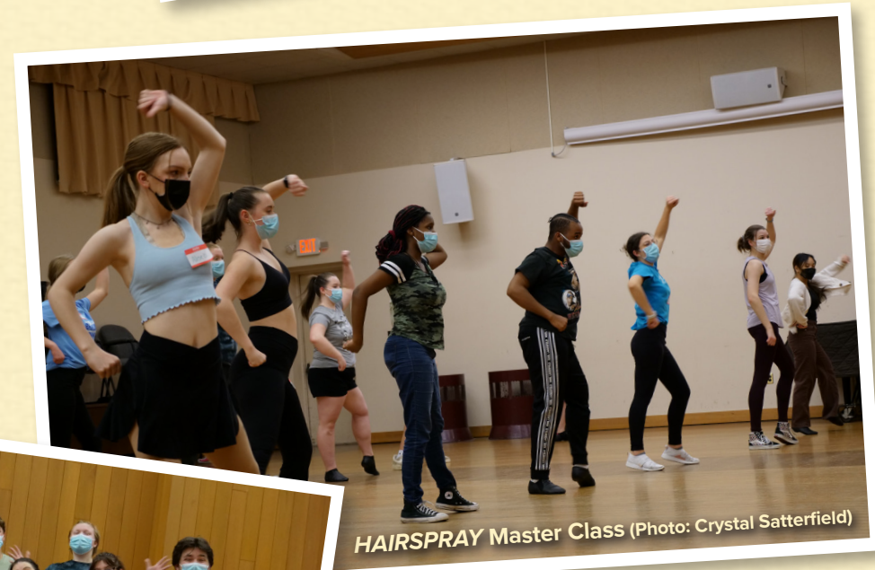
HAIRSPRAY Master Class

Remaining educational opportunities in 2022–2023 will include Broadway master classes with ELF , SIX , BEETLEJUICE , and AIN’T TOO PROUD and acting, singing, and technical workshops with local and regional artists.