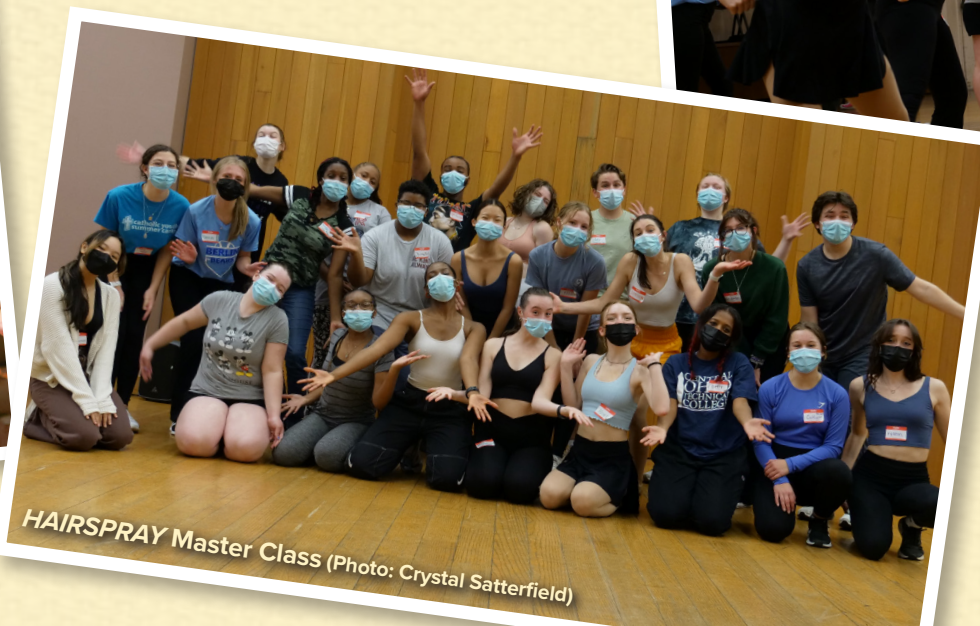
HAIRSPRAY Master Class