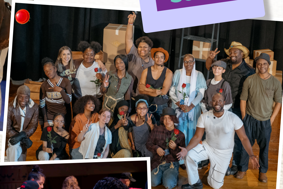
West High School