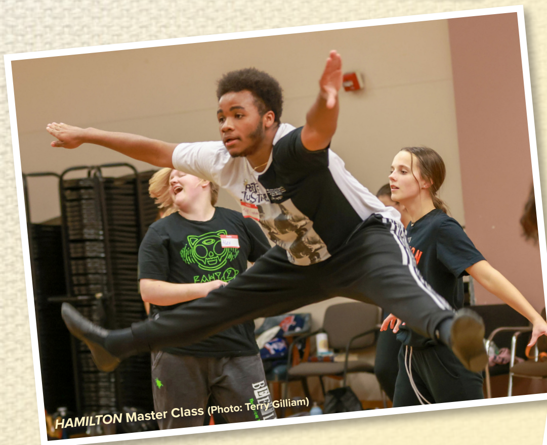
HAMILTON Master Class