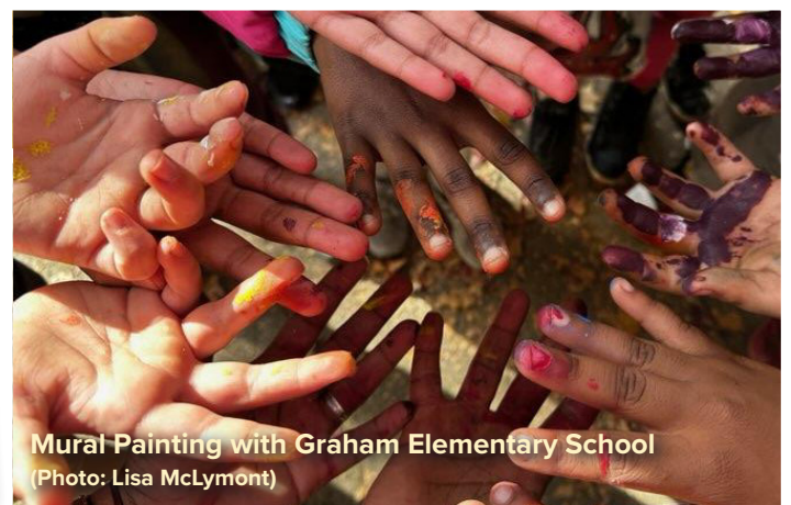
Mural Painting with Graham Elementary School