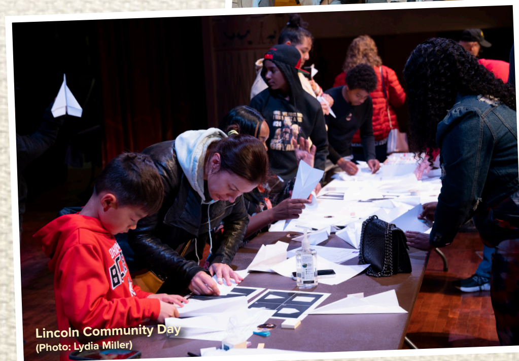
Lincoln Community Day